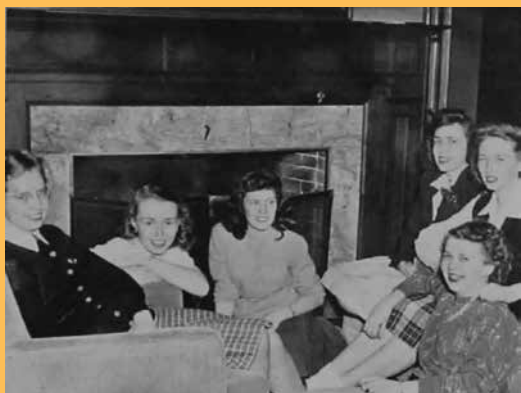
A group relaxing in Lyon Hall from the 1947 Bomb, the Iowa State University yearbook.

To learn more, contact the office of gift planning at 800.621.8515 or visit isugift.org .